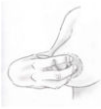
Fig. 1 One-handed "flower hold" Fingernails short, Fingertips curved placed where baby's tongue will go