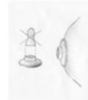
Fig. 6 Soft-ring method. Cut off bottom half of an artificial nipple to place on areola to press with fingers

Illustrations by Kyle Cotterman, Reverse Pressure Softening by K. Jean Cotterman © 2008