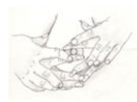
Fig. 3 You may ask someone to help press by placing fingers or thumbs on top of yours