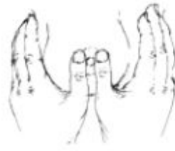
Fig. 5 Two-step method, two hands using straight thumbs, base of thumbnail even with side of nipple. Move ¼ turn, repeat, thumbs above & below nipple