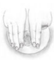
Fig. 4 Two-step method, two hands using 2 or 3 straight fingers each side, first knuckles touching nipple. Move ¼ turn, repeat above & below nipple.