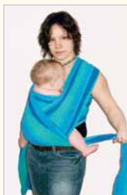
CROSS FABRIC OVER BABY AND KNOT IN BACK.