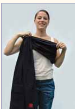
CREATE A POUCH FOR BABY.