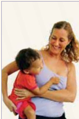
SCOOT BABY ONTO YOUR BACK.