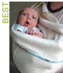
Pulling more fabric against the wearer's chest and/or moving the pouch seam slightly behind baby's back can change the pouch's depth.