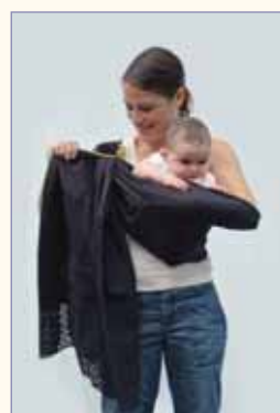
TIGHTEN ANY SLACK BY PULLING ON THE TAIL.