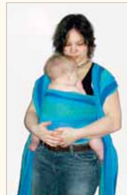
PULL OPEN THE POCKET AND SETTLE BABY IN.