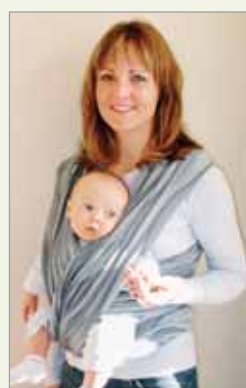
front facing out, legs out