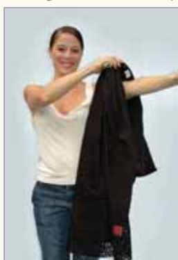
SLIP THE SLING OVER ONE ARM AND HEAD.