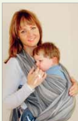
snuggle, front facing in (tummy-to-tummy)