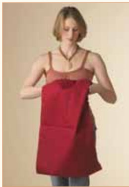
FOLD TUBE OF FABRIC.