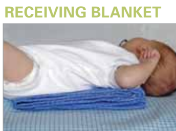
To keep baby centered on the folded blanket, it is often easier to spread out a receiving blanket, place a second folded blanket on top of that, then center baby on the second folded blanket.

If you are using a folded receiving blanket in a shallow pouch, place it only behind baby's back, not behind baby's head.