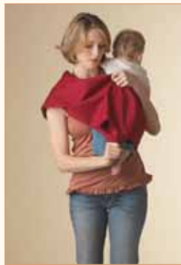
DROP BABY IN.