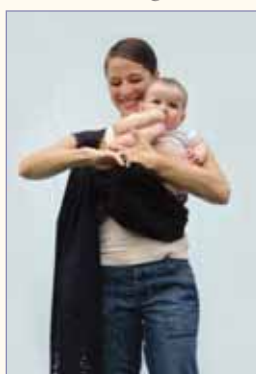
SETTLE BABY INTO THE SLING.