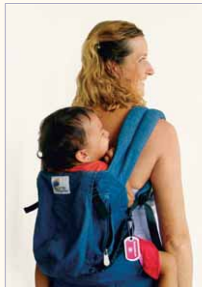
CHECK THAT PANEL IS HIGH ON BABY'S BACK AND BABY IS SEATED DEEPLY IN THE CARRIER.

Tips: Because soft carriers are more structured, there is often difficulty fitting those wearers who are not of average build. Mamas under five feet tall find the shoulder straps too long, and those over six feet may find the straps too short. Very thin or plus-size parents may also find it challenging to achieve a comfortable fit. Because in a soft-pack carrier the baby always faces the wearer, this type of carrier is not optimal for an infant who insists on facing outward.