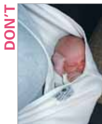
Pouch is too big for mom, and baby is hanging too low; no support pillow under baby.