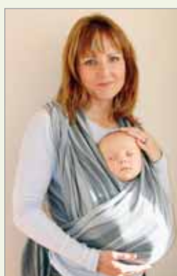
front facing out, legs in (kangaroo)