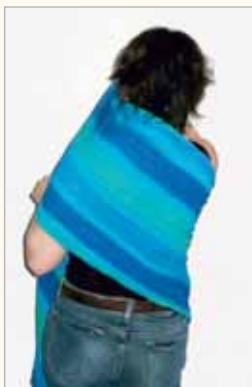
BRING FABRIC AROUND TO THE BACK AND OVER YOUR SHOULDER.