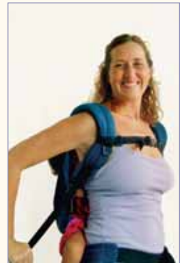
TIGHTEN SHOULDER STRAPS.

Soft-pack carriers are based on Asian-style carriers but are modernized with buckles, extra padding in the shoulder straps, and/or a wide, padded waist belt to distribute weight onto the hips. This style of carrier is the easiest two-shoulder carrier to learn. It bypasses the “dragging strap problem” of Asian-style and wrap carriers, and its backpack-like style appeals to dads. Even though they do not have a frame, soft-pack carriers are still fairly structured. As such, they tend to offer fewer positioning options, and are much less adjustable than the unstructured Asian-style carriers on which they’re based.