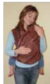
Cuddling with mom, asleep in gauze wrap.

Proper positioning correctly distributes the child's weight, so that carrying will not be painful, even as the child grows.