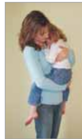
Pulled in close with legs wrapped around mom's waist.

For a baby carrier to be comfortable, it needs to hold the child at the same level and height as when the child is held in the wearer's arms.