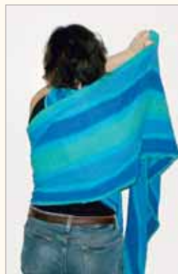
REPEAT WITH THE OTHER SIDE, MAKING AN "X" ON YOUR BACK.