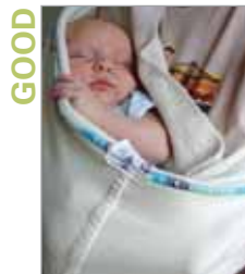
Equal amount of fabric in front of and behind baby, and bum is centered on pouch seam.

The amount of modification necessary to correctly position an infant in a pouch depends on the depth of the pouch and the size of the baby. Usually, once baby weighs between 8 and 12 pounds, modifications are no longer necessary.