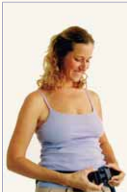
BUCKLE WAIST BELT.