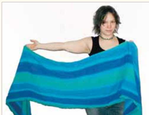
CENTER THE WRAP IN FRONT OF YOU.