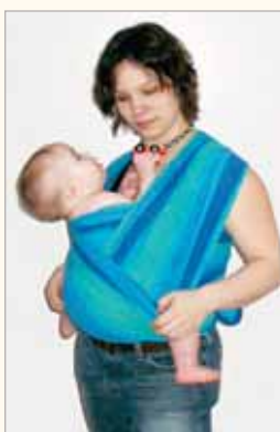
MAKE SURE FABRIC IS SPREAD OUT.

A wrap, or wraparound carrier, is a long, rectangular piece of cloth. Wraps are the most unstructured of baby carriers, and learning to use them demands patience and flexibility. But the effort is well worth it: wraps are incredibly, magically comfortable, and can be tied in a multitude of ways to suit many body types and carry positions.