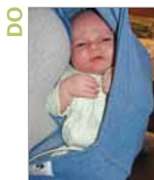
Mom is using a smaller pouch, and support pillow is under baby.