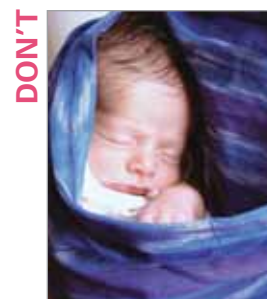
One of the most common mistakes made with ring slings is positioning the baby in the pouch parallel to the rails. This basically folds the baby in half.

If baby is too "deep" in the sling, pull on the tail, focusing on the middle of the sling, until the pouch is the right depth to raise and straighten baby.