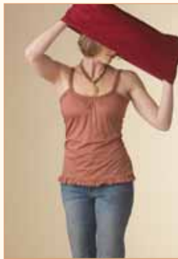
SLIP OVER YOUR HEAD.