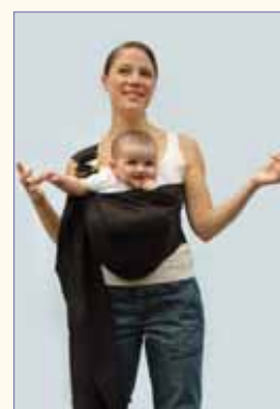
MAKE SURE BABY IS SECURE. VOILÀ!

A ring sling is a long loop of fabric that runs through a set of adjustable rings. There are two types of ring slings: closed-tail and open-tail.