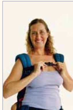
BUCKLE STERNUM STRAP.