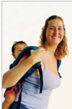
BRING UP PANEL AND SHOULDER STRAPS.