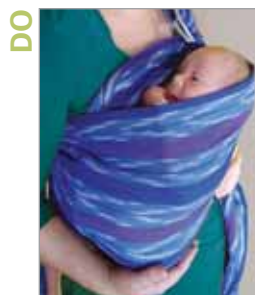
To correctly place an infant in an open-tail sling, begin by putting the baby in more of a tummy-to-tummy position, with her trunk perpendicular to the rails; then slide baby down into the sling by lowering her upper body sideways.

Baby's body should lie diagonally across the width of the sling, her head nearer the outer rail and her legs nearer the inner rail. This allows baby's body to stretch out,