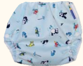
Mother-ease bubble wrap

Bubble wraps: These are usually made of polyurethane-laminated cloth and fasten with snaps at the sides. They run big, to allow airflow so the diaper can "breathe." Sizes in this cover style overlap quite a bit, but Smalls should fit most babies for a long time. If your baby fits into a Small for six months, you might be able to skip to a Large and save by not buying Mediums. This will depend on your baby's build: Chubby babies often skip sizes, but skinny babies don't. When used under bubble wraps, prefold diapers must be pinned. $8 to $12 each.