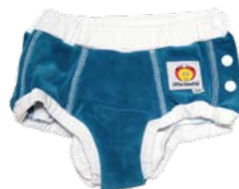
Little Beetle training pants

Additional links for training pants: www.imsevimse.us , www.kushies.com , www.theecstore.com , and www.snap-ez.com .