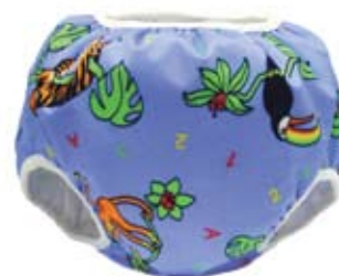
Bummis pull-up training pants

Some people find that their cloth-diapered babies potty-train more easily and earlier than their disposable-diapered peers.