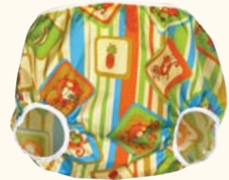
Bumkins pull-up pants

Pull-up pants: In the past, these covers were usually made of plastic, but many advances have been made in recent years. Pull-ups are now often made of polyurethane-laminated cloth, which waterproofs the cloth so that the diapers don't leak through. Prefolds must be pinned in order to be used with pull-ups, and you'll have to buy several sizes as your baby grows. They come in all sorts of colors and patterns, and cost from $6 to $15 each.