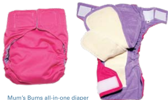
Mum's Bums all-in-one diaper

All-in-one diapers: All-in-ones are the closest cloth option to disposables in terms of fit and ease of use. They consist of a fitted diaper with an attached waterproof layer that serves as a cover, and fasten with Velcro or snaps. Many parents who use prefolds or contours at home use all-in-ones for daycare, outings, or babysitters. Even die-hard users of disposables don't have problems using a one-piece cloth diaper that fastens with Velcro the same way a disposable fastens with tape. Although all-in-ones sell for $10 to $25, in the long run the cost isn't as much as it seems because covers aren't required.