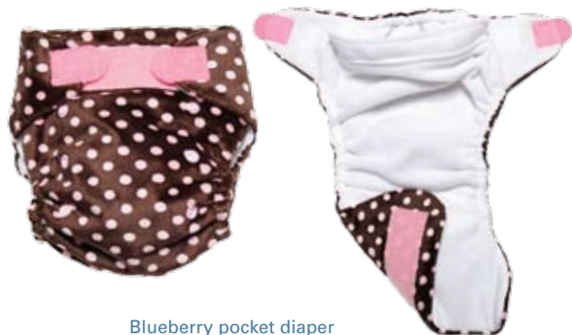
Blueberry pocket diaper

Pocket diapers: The latest advance in cloth diapers, pocket diapers consist of a waterproof outer layer and a soft inner layer, often of microfleece. These are sewn together along the edges, leaving an opening in the front or back. To complete the diaper, you insert in the pocket anything absorbent: a hand towel, a prefold diaper, or one of a number of specially made inserts. Once the insert is in, pocket diapers work like all-in-ones, and close with snaps or Velcro—no additional cover is needed. Moisture passes through the inner fleece layer into the insert, leaving the baby dry. A great advantage to pocket diapers is that you can customize the insert's absorbency, increasing it for night use, naps, or heavy wetters. Many parents who use other kinds of cloth diapers during the day—even disposables—use pockets as their nighttime system. They average $15 each.