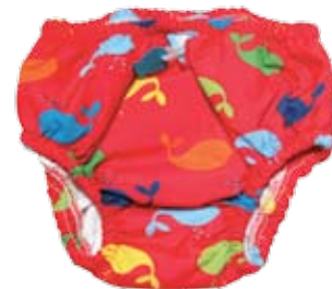
i play swim diaper

Training pants: When it comes time to potty train, you can stick with cloth throughout the process. Some people find that their cloth-diapered babies potty-train more easily and earlier than their disposable-diapered peers. Many types of cloth training pants are available. The oldest and most easily found are cotton underwear with a thick absorbent middle panel. If you use these, both you and your child will know right away when accidents occur, which helps some children learn to use the potty more quickly.