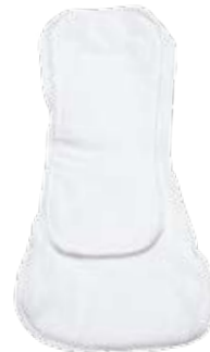
Haute Pockets pocket liner

When my baby was born, I used prefold diapers with Velcro wraps because they seemed to be the best value while still being easy to use. These worked great when my baby was a newborn, but as he grew older and we were more often on the go, I looked for an easier option. After trying a few different kinds, I settled on pocket diapers. One reason was that the prefolds I'd already purchased worked well as pocket inserts, so that initial investment wasn't wasted. Because our baby was almost big enough for the largest size of pocket diaper, we bought a stock of those, then continued to use prefolds and wraps until he grew into them. All of this represented an investment of about $700; our only additional costs were for detergent and water.