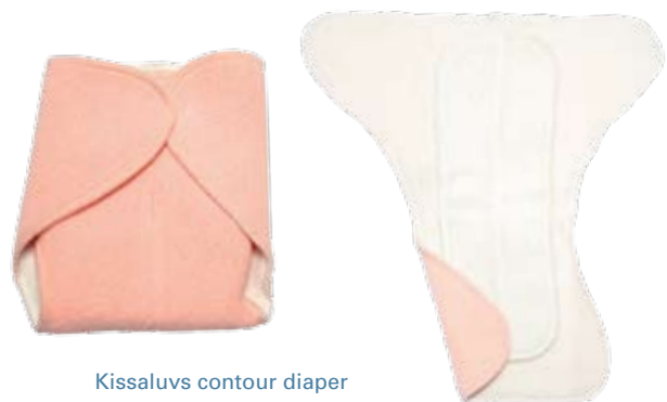
Kissaluvs contour diaper

Contour diapers: These diapers are the next step up in price from prefolds, but they're also a step up in convenience. Like disposables, contour diapers are shaped like an hourglass, and usually have thick padding in the middle. They can be laid directly in a wrap without having to be folded, and can therefore be easier than prefolds to put on a wiggly baby. Contours must be used with one of the types of covers described on page 12, and need to be pinned when used with pull-up pants, bubble wrap, and some wool covers. Due to their shape, you may have to buy two sizes of contours for your baby's diapering lifetime. Prices range from $6 to $10 each. (continued on page 13)