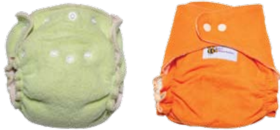
Fitted diapers by Kissaluv's and Baby Beehind

Fitted diapers: These have elasticized waists and legs and fasten with snaps or Velcro. Most fitted diapers come in several sizes; you'll probably need at least two different sizes over your baby's diapering lifetime. Some fitteds, however, can be snapped or folded down to fit newborns, then expanded to fit babies up to potty-training age. Fitteds work well with any of the covers described above; many parents use pull-up pants, which tend to be the least expensive covers. Costing from $8 to $20 each, fitted diapers are at the higher end of the price range but can be a great deal in the long run.