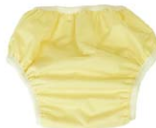
Happy Heiny's pocket trainers