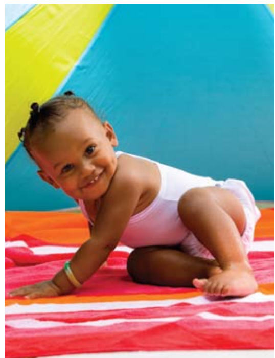
Right: Taking the swim diaper one step further: This little girl is wearing a swimsuit with a built-in swim diaper.

Cloth diapers directly save thousands of tons of solid waste from ending up in landfills each year, put human waste in sewer or septic systems where it belongs, and require a relatively small amount of water per wash—equivalent to just five flushes of the toilet. Proponents of disposables may argue that washing cloth diapers until your child is potty-trained uses more water and energy than are used to manufacture an equivalent amount of disposables. Take this argument to the trash by using the most resource-efficient washer and drier you can find (or use the free sunshine to dry), or by conserving household water and energy in other ways. After all, you