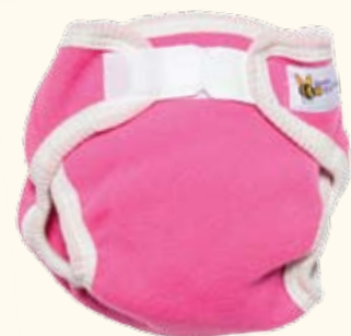
Baby Beehind wool wrap

Wool wraps and pants: For parents who love natural fibers, wool covers are the way to go, and are available in both wrap and pull-up pants styles. Wool is water-resistant, not waterproof, but these covers are likely to leak only if the diaper is totally saturated, and at that point you'd want to change it anyway. Wool neutralizes urine, and wool covers can be used many more times before washing than other covers can. They need to be washed only every few weeks, or when soiled. However, wool is expensive; these covers cost between $18 and $40 each.