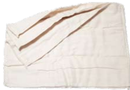
Bummis prefold diaper

Prefolds must be combined with a diaper cover (see page 12), of which there are several kinds.