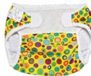
Bummis swim diaper

If you use another system, you can buy a diaper specifically designed for swimming. Most are made of material similar to that used in women's swimsuits and look a little like bikini-style underwear. Some come with snaps on one or both sides for easy removal in case of a bowel movement. Some companies make girls' swim tops to match the swim diapers (see photo at bottom of page 8), and a few also make, for boys, swim shorts with an inner diaper. Reusable swim diapers have become so popular that you may be able to find one at your local baby or department store, or online. Two links for swim diapers: www.imsevimse.us and www.kushies.com .