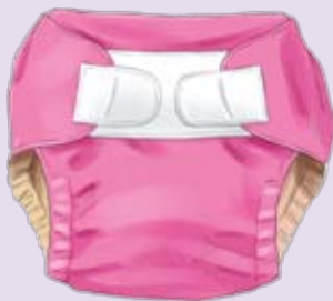
hook and loop