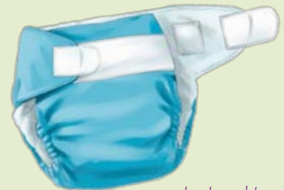
hook and loop